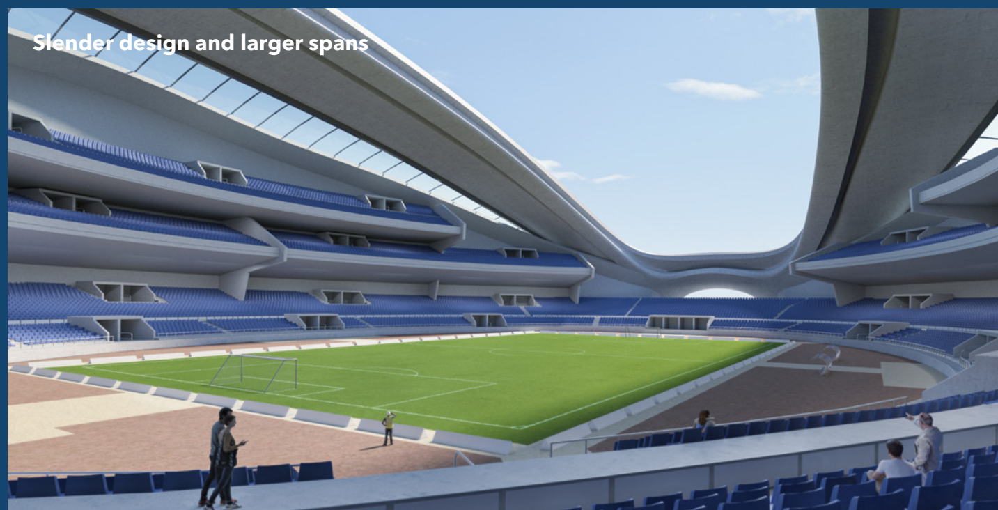
Slender design and larger spans