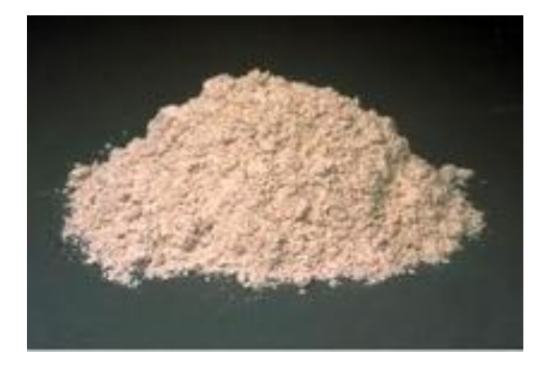
Figure 1 Slag Cement (ground granulated blast furnace slag)

SCA members shipped in the order of 3.5 million metric tons of slag cement in 2013. About 5% of the members' 2013 slag cement shipments were direct imports from Asia. Similarly, about one third of the GBFS was also imported, primarily from Asia and Europe, for further processing at SCA member US and Canadian grinding facilities. The remaining production of slag cement (two thirds) was derived from US and Canadian GBFS sources.