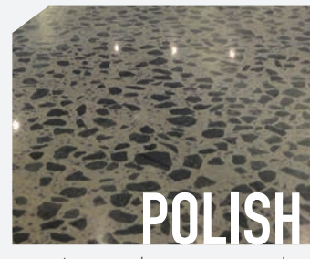
A smooth concrete with a texture like polished marble