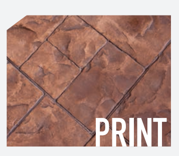
A beautiful range of durable patterns and textures