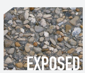
A robust exterior concrete with a gravelled finish