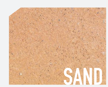
A concrete with the look and feel of natural sand

YOUR ARTEVIA PROJECT TAKES JUST 4 STEPS.