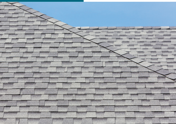
PARTICLE SIZE DISTRIBUTION