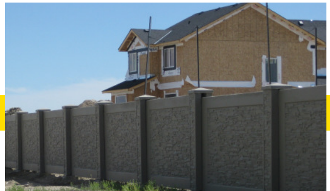
Using both Chronolia® 4H helped Cast in Stone Fences by DDS Consulting accelerate their construction speed.